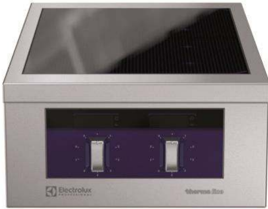
589025 (MCIBAAEOAO) Induction Top, 2 zones, one-side operated